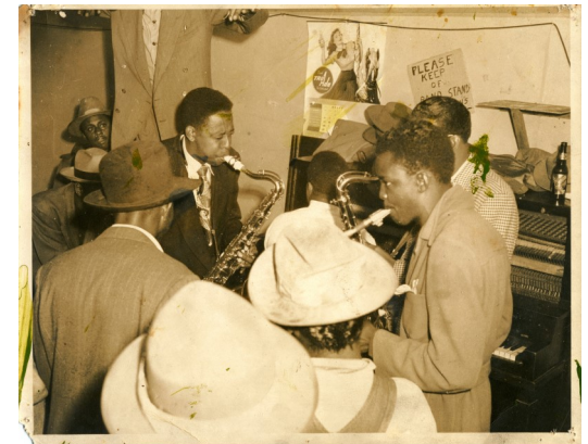
Saxophone players performing in nightclub.