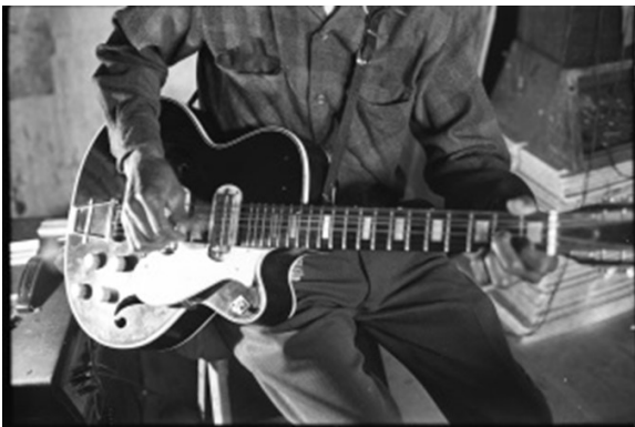
Blues musician Jesse Fuller playing guitar in his basement.

Jesse Fuller (1896-1976) was born on Jonesboro, Georgia in March 12, 1896. In 1954 Fuller recorded his most notable song, "San Francisco Bay Blues", and by 1960 Fuller booked a European tour, and devoted himself full time to music. Jesse Fuller Records consists of newspaper clippings, photographs, and audio recordings.