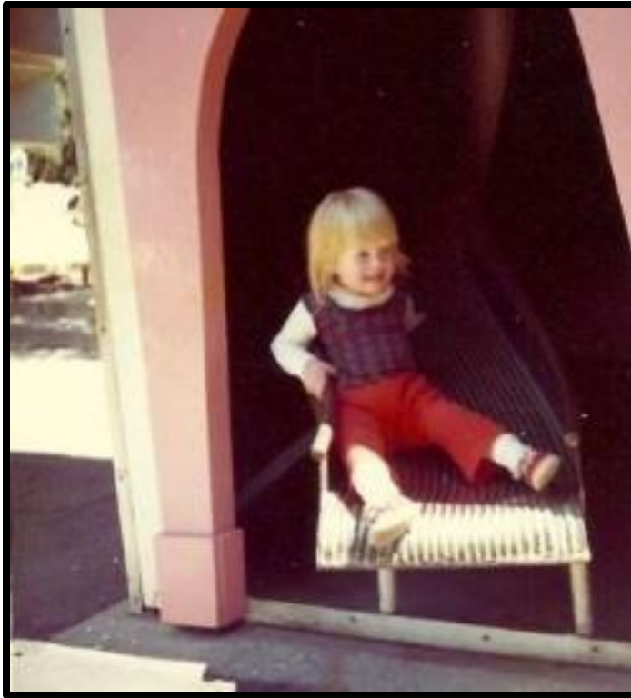
Children's Fairyland, ca. 1973