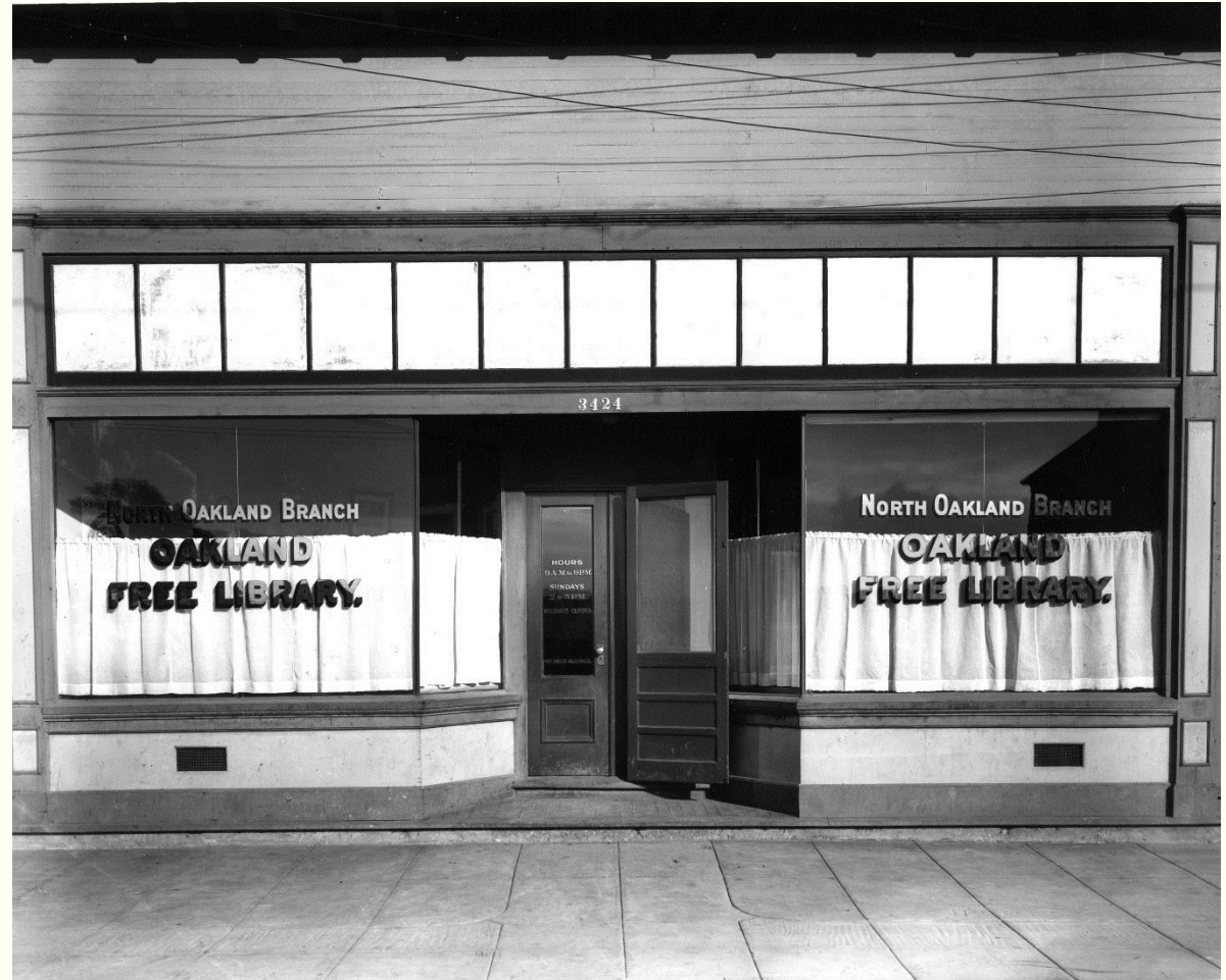
(circa 1950s)