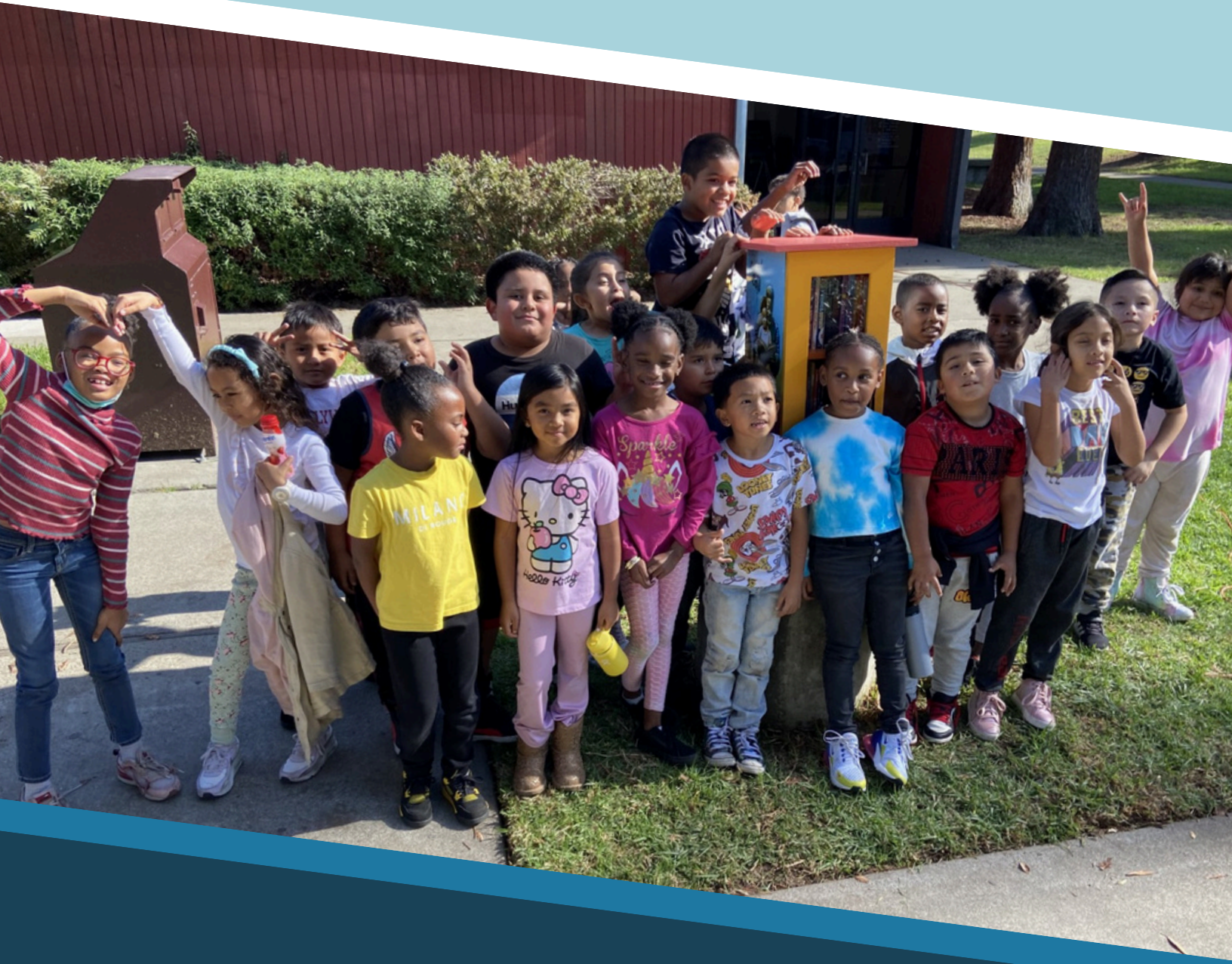
Little Town Library at the Ira Jenkins Recreational Center, East Oakland, California