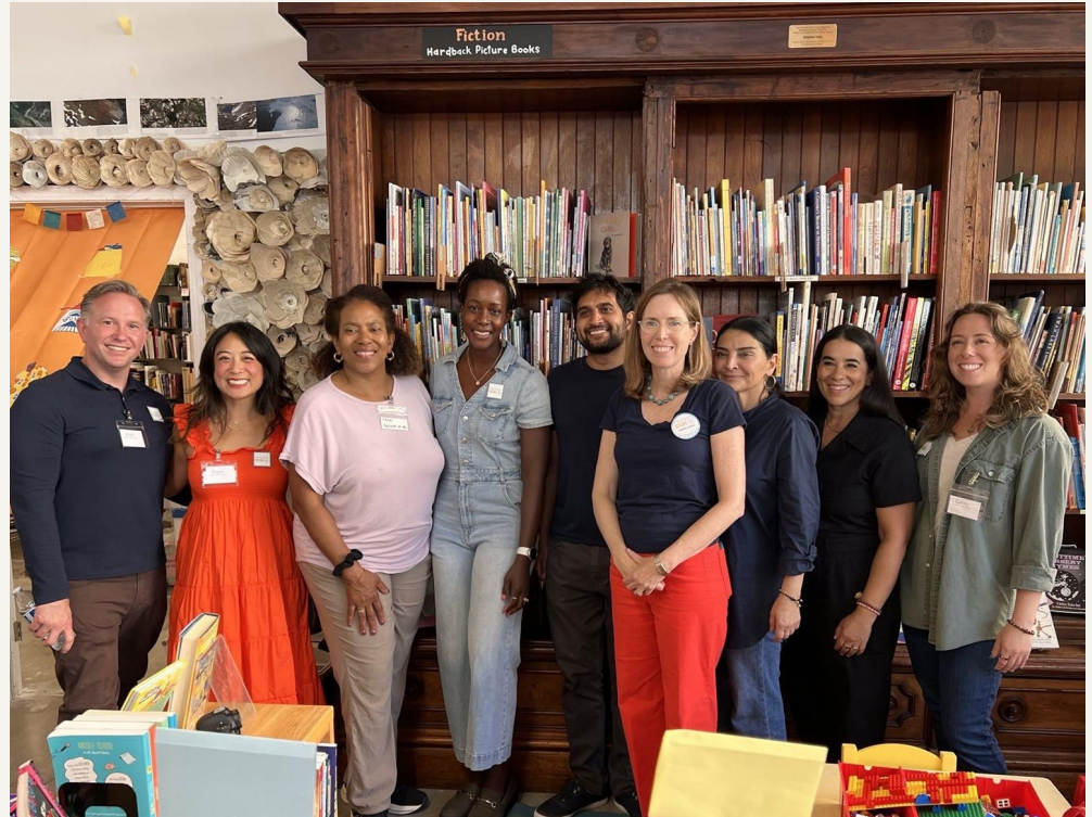
The Friends are supported by 200+ volunteers and paid managers of the Bookmark. Above are about half of our Board Directors at our 75th Anniversary Open House.