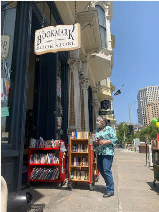
Former Washington Street location