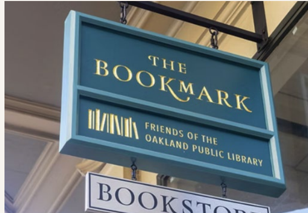
New 933 Broadway store